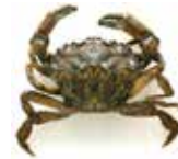
European green crab