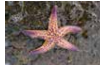
Northern Pacific seastar

The species below already occur in some parts of Tasmania, but we want to reduce their spread to other areas.