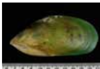
New Zealand green-lipped mussel