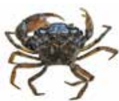
Harris' mud crab