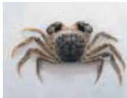
Chinese Mitten Crab

The following species aren't currently found in Tasmania, and it is a high priority to keep them out of our waters. So, if you spot them, report them immediately.