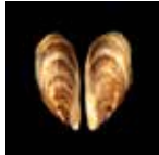
Black-striped false mussel